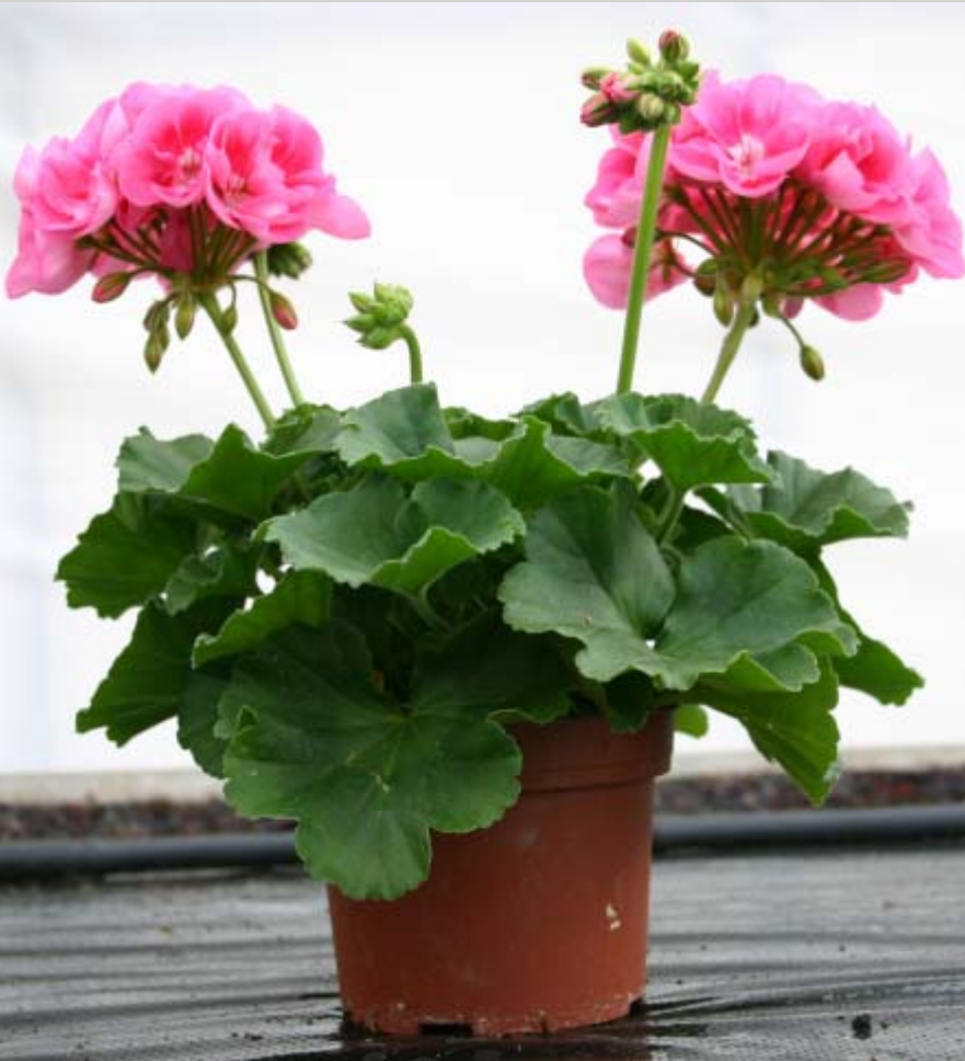
Candy Rose w/blotch