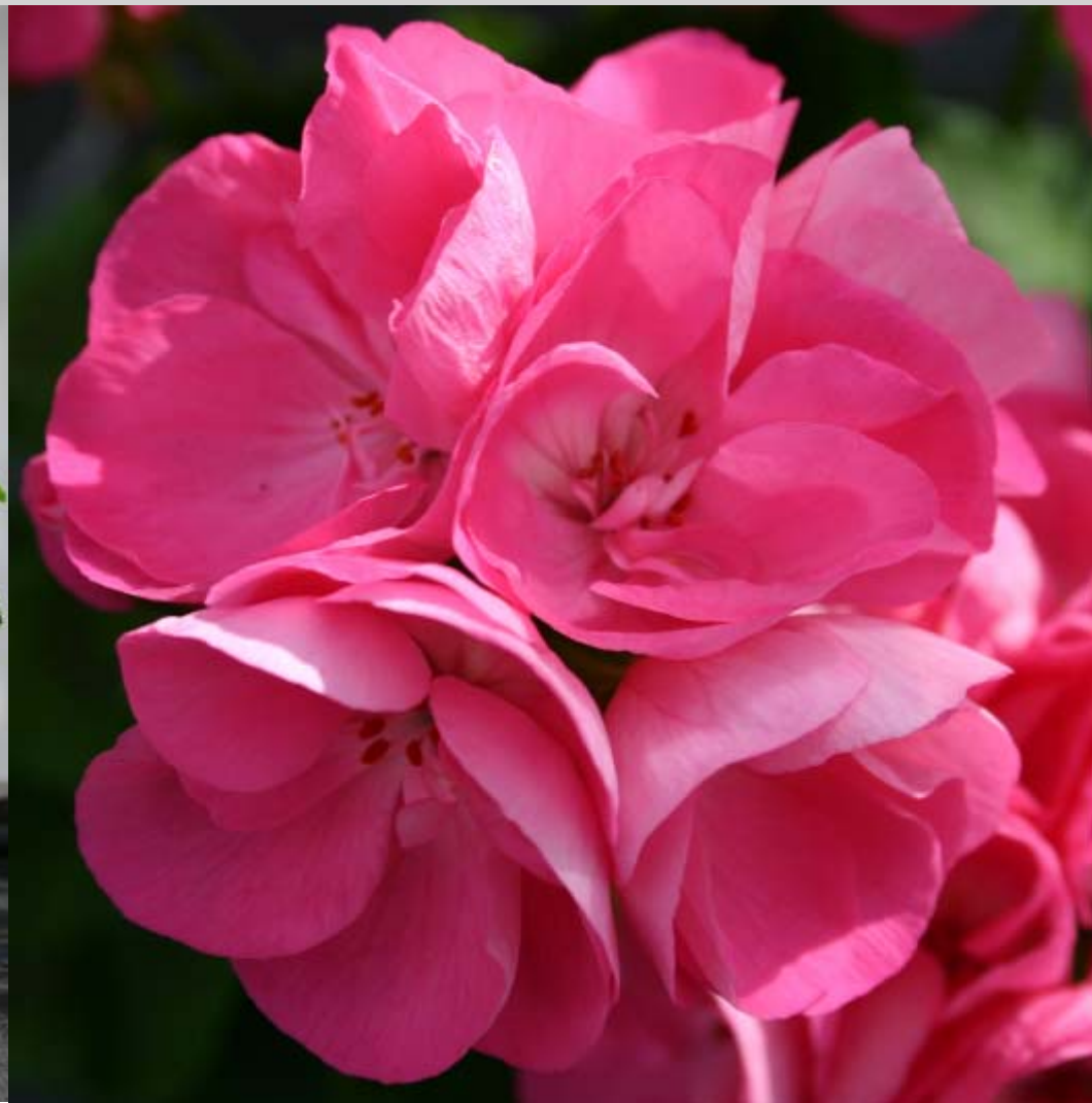
Candy Rose w/eye