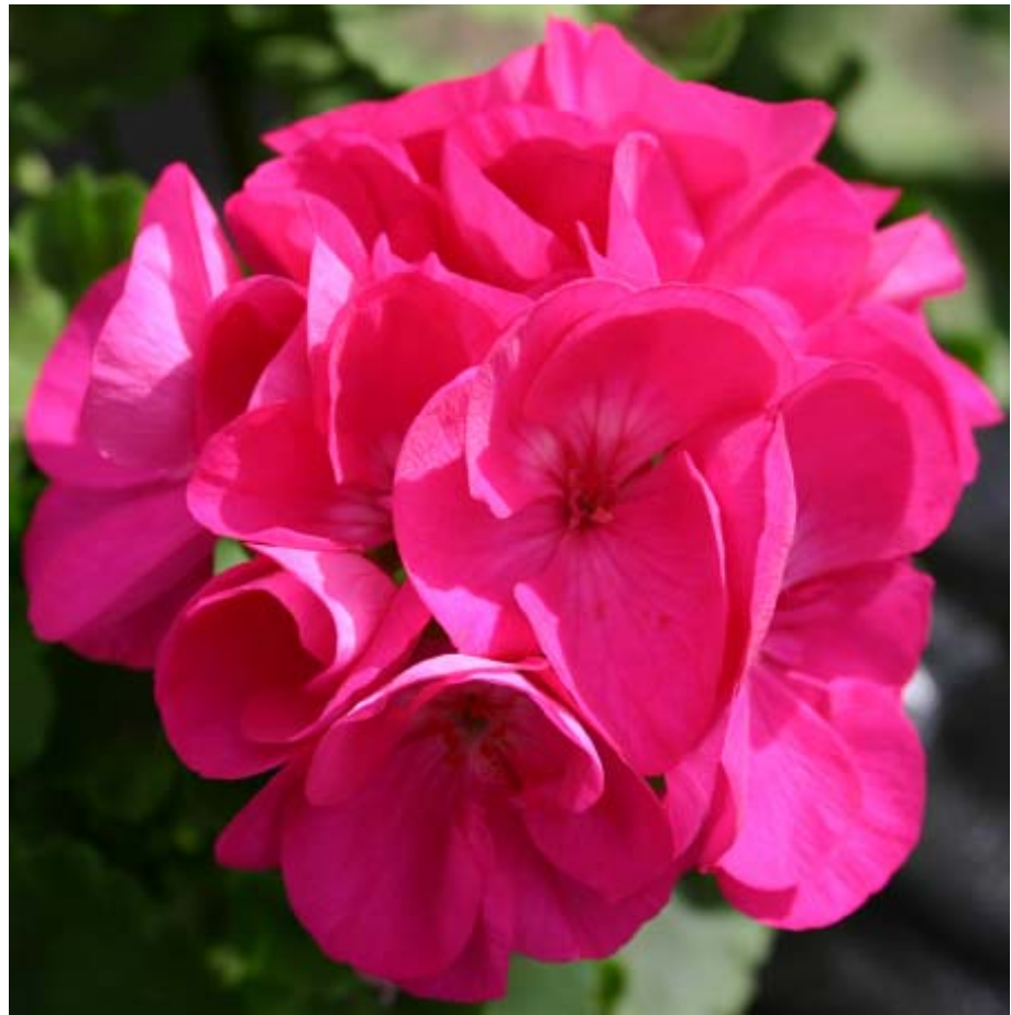
Dark Rose w/eye