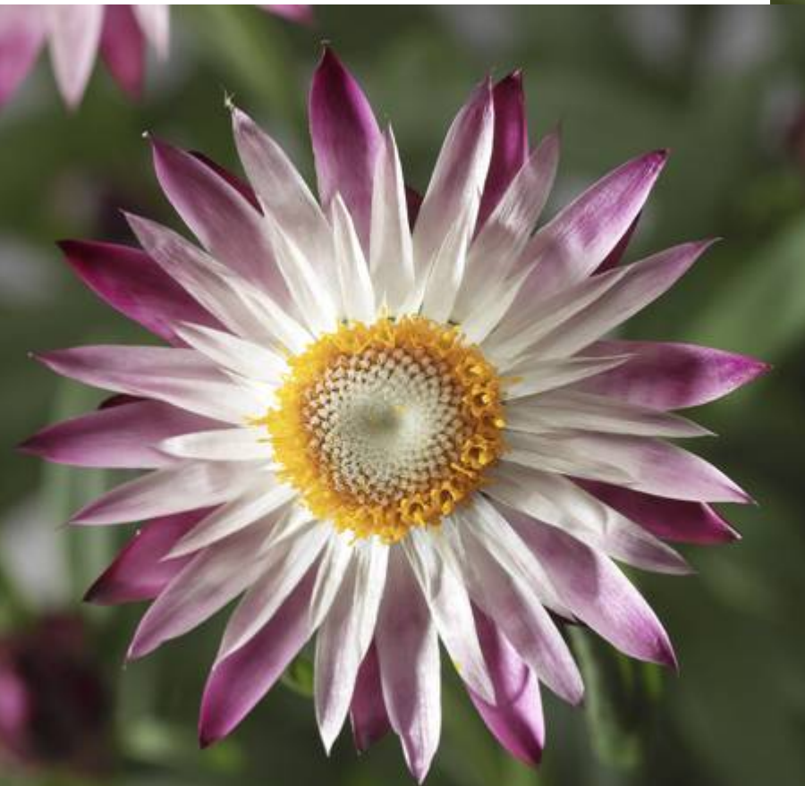
Bi-color White Rose